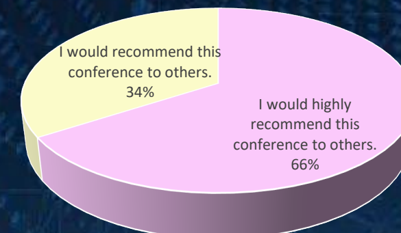
Results of the questionnaire for the audience after the lecture (N=38)